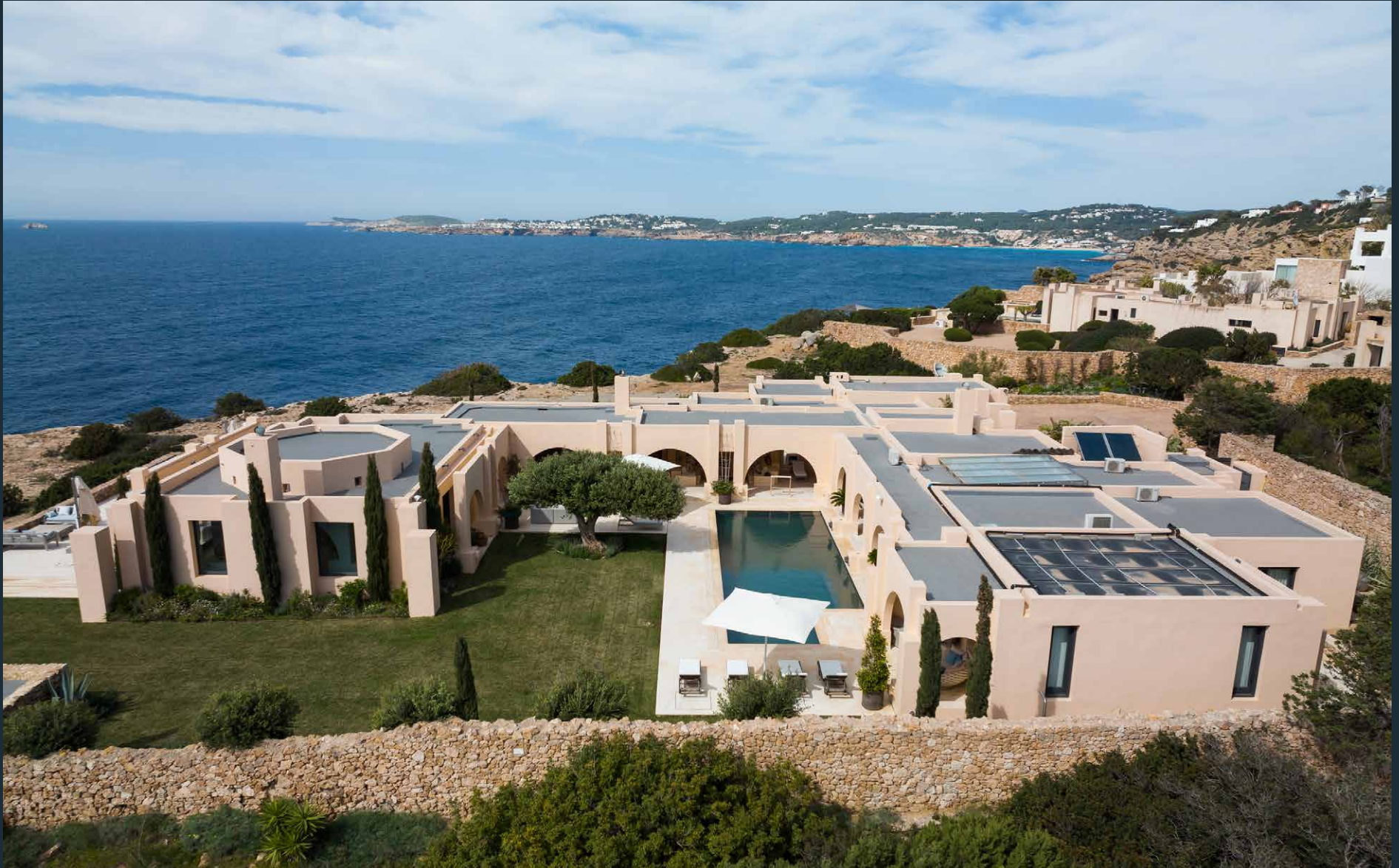
Villa Hermosa, Cala Vadella