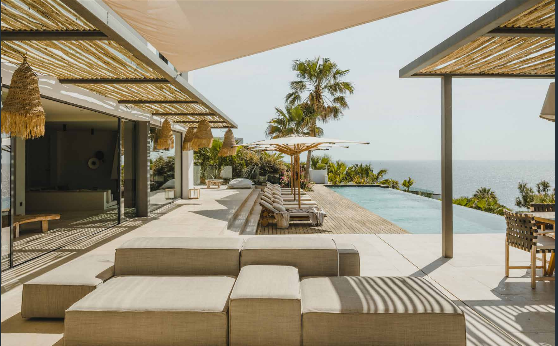
Villa Elevado, Roca Llisa For 12 guests