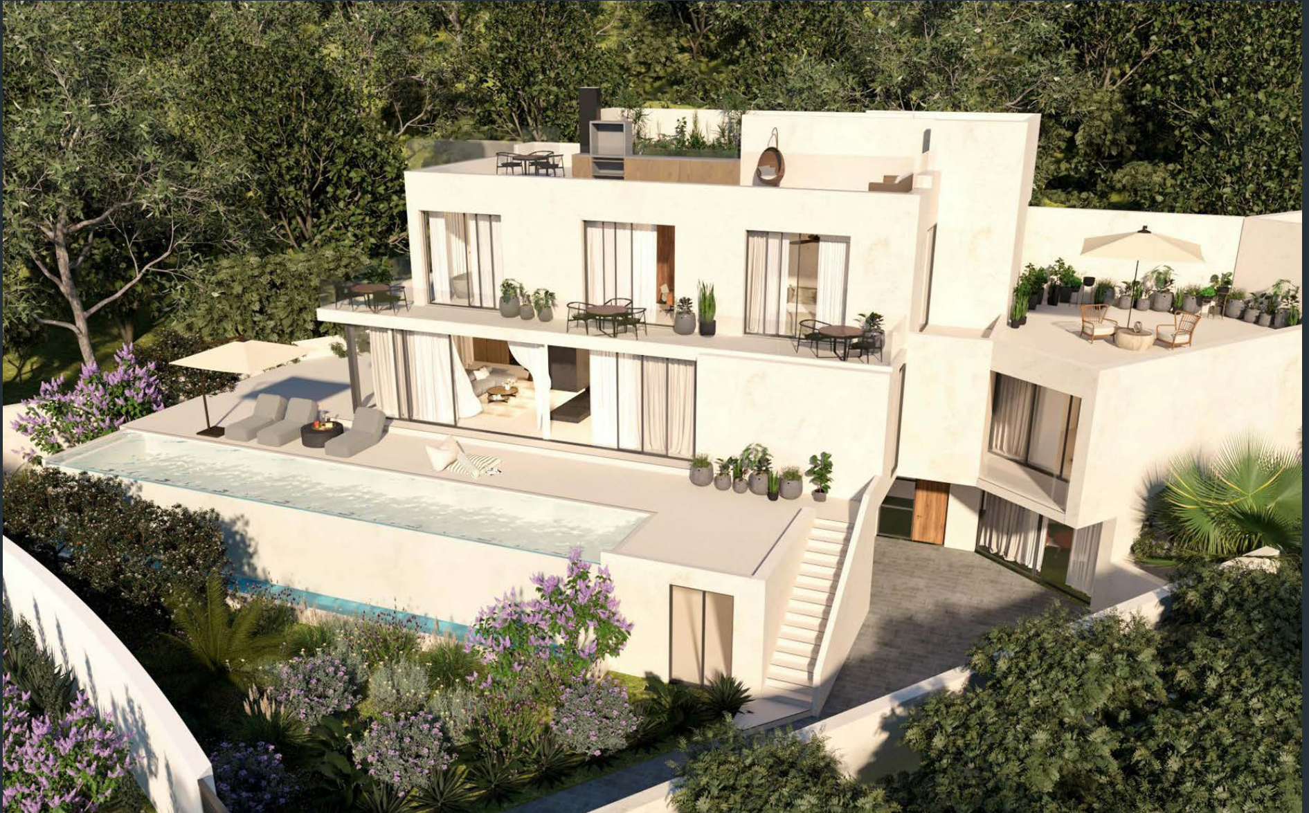
Villa Cuarzo, South West €7,700,000