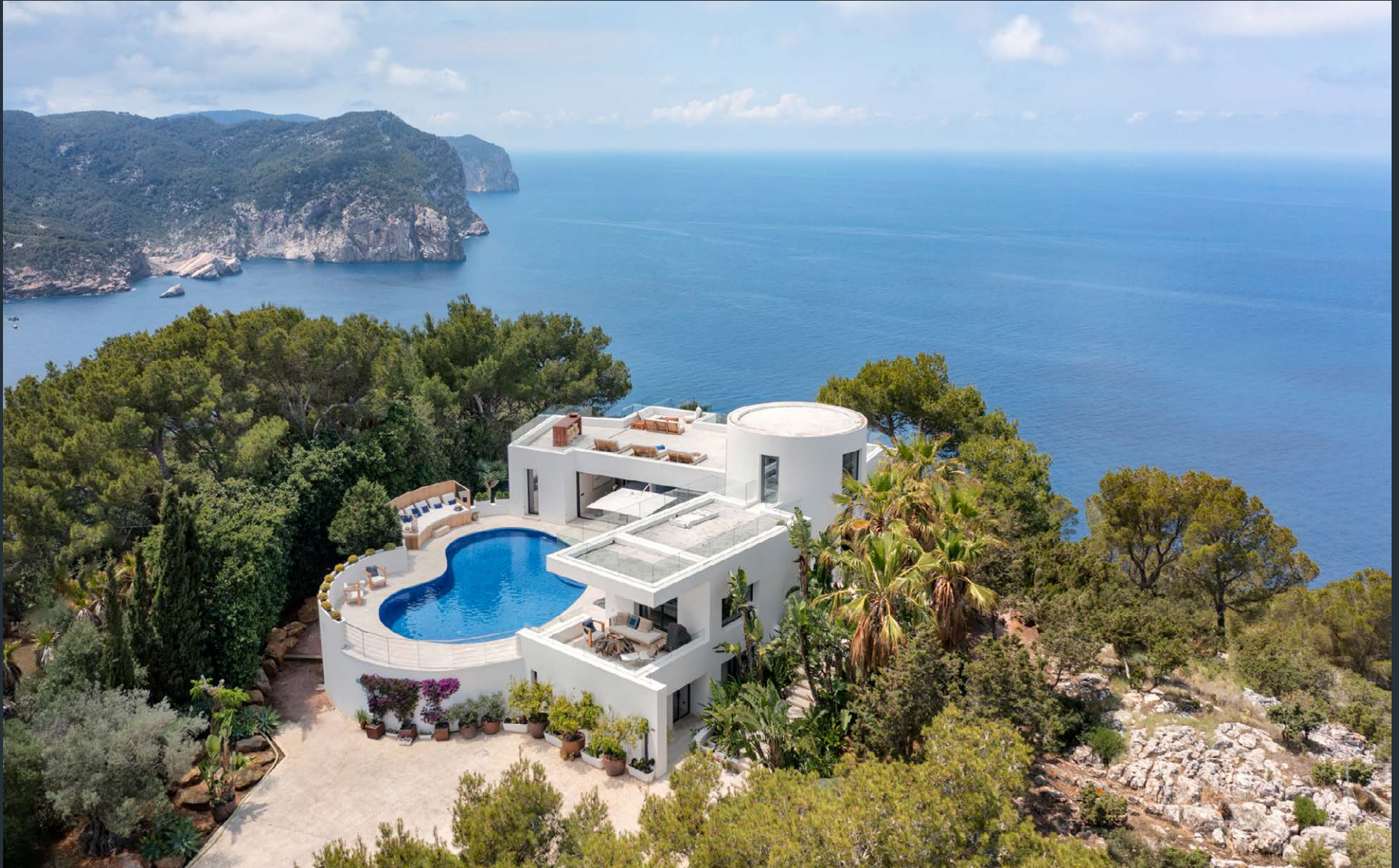
Villa Azul, North West For 10 guests