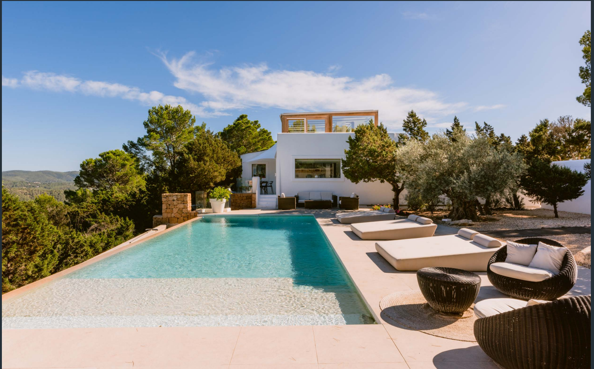
Villa Adriana, San Miguel €4,700,000