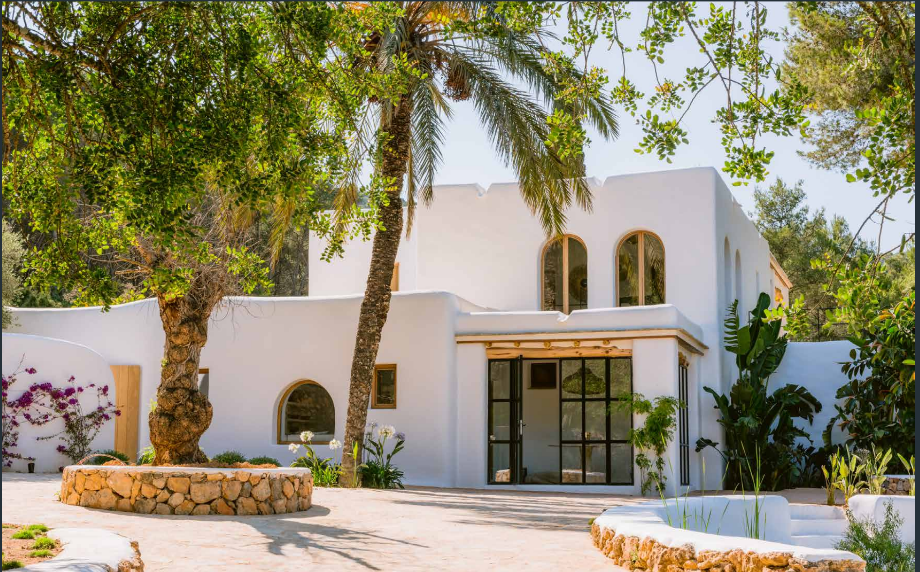
Finca Mirabelle, South Ibiza €4.750.000