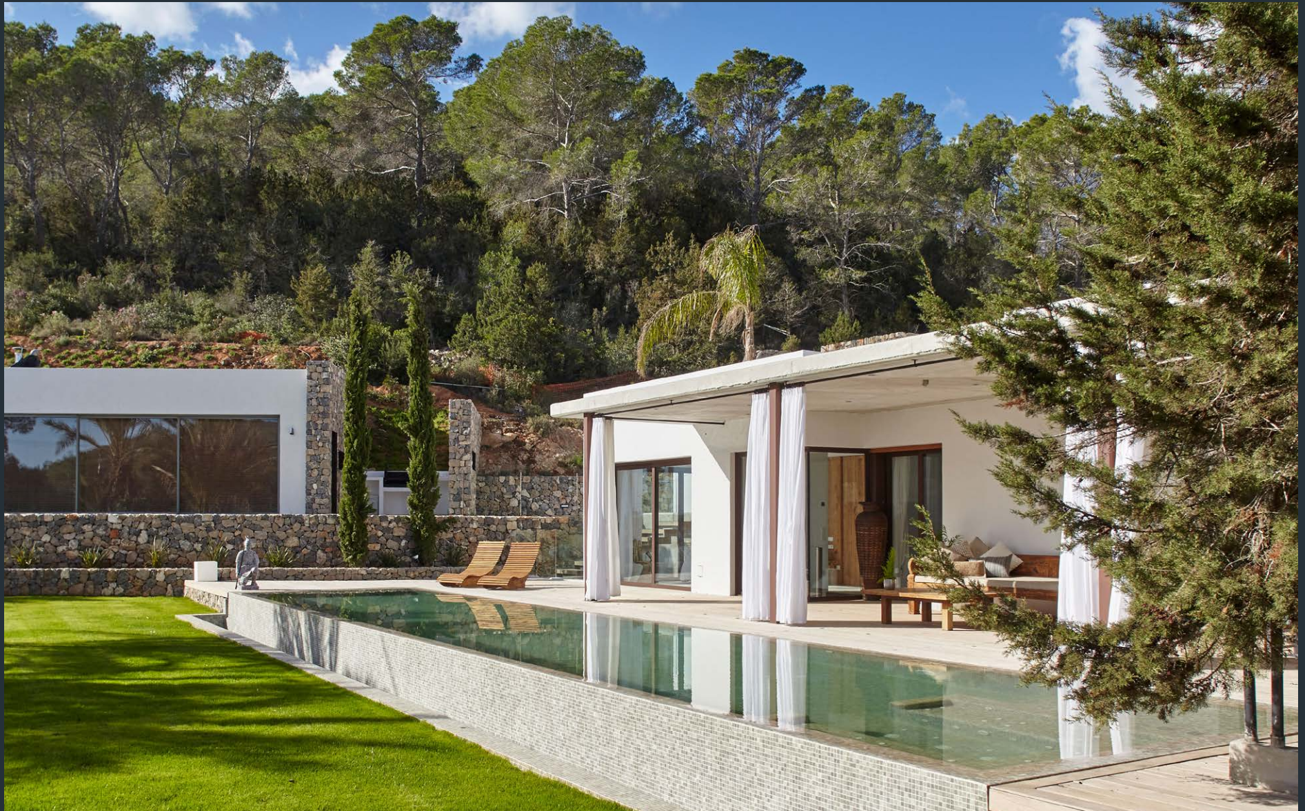
Villa Matisse, San Jose For 10 guests