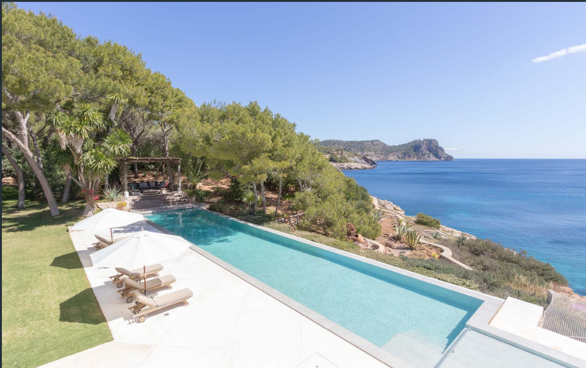
Villa Mastella, San Carlos For 18 guests