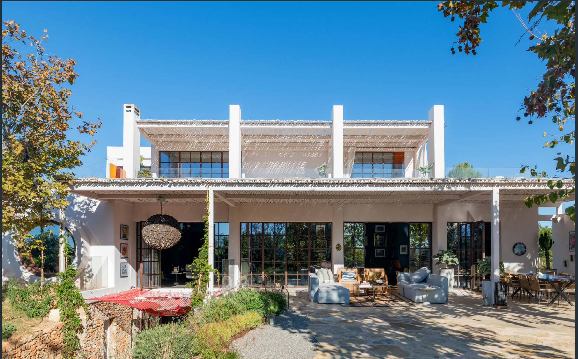
Villa Estilo, San Miguel For 12 guests