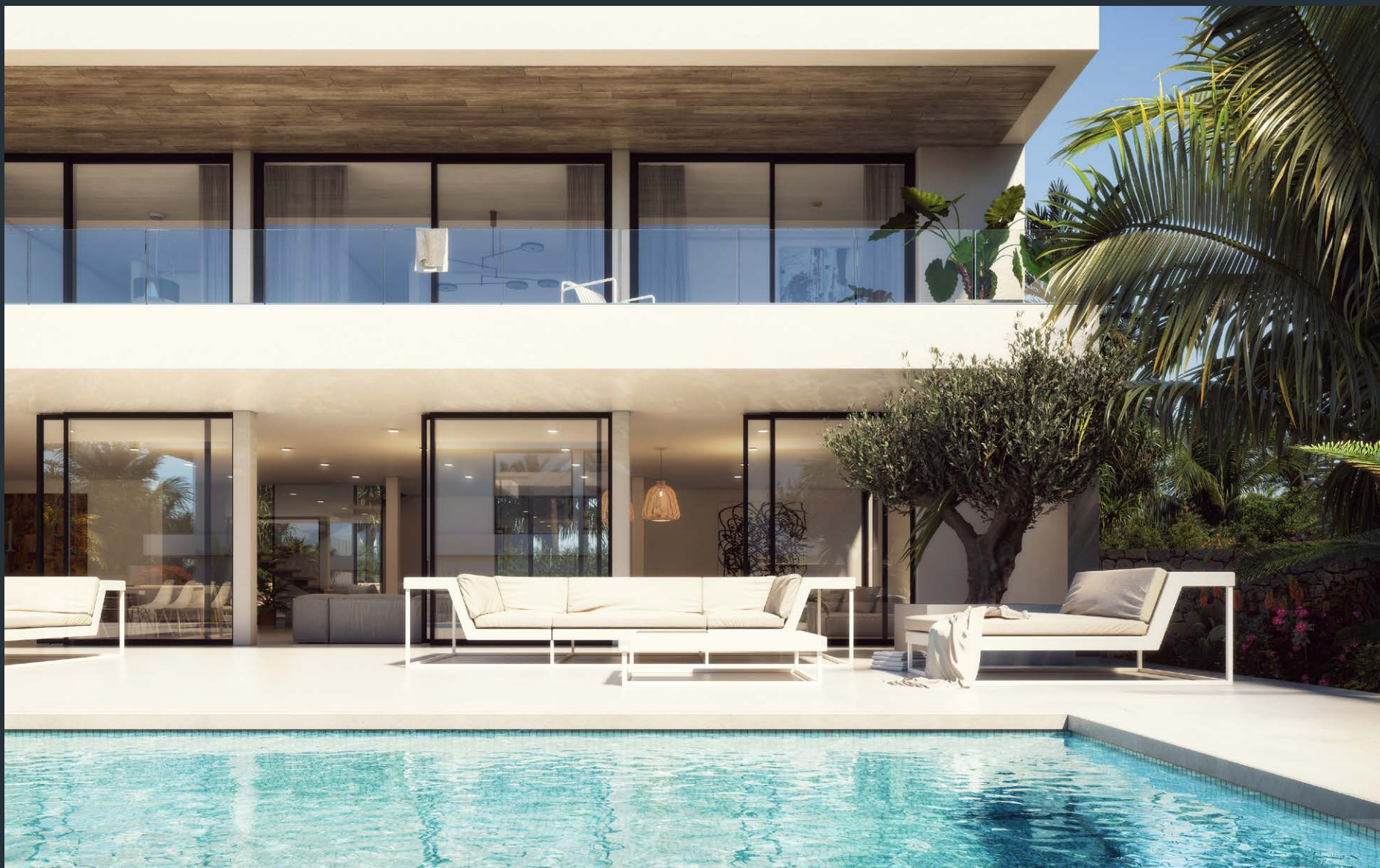
Villa Brise, Talamanca € 4.295.000