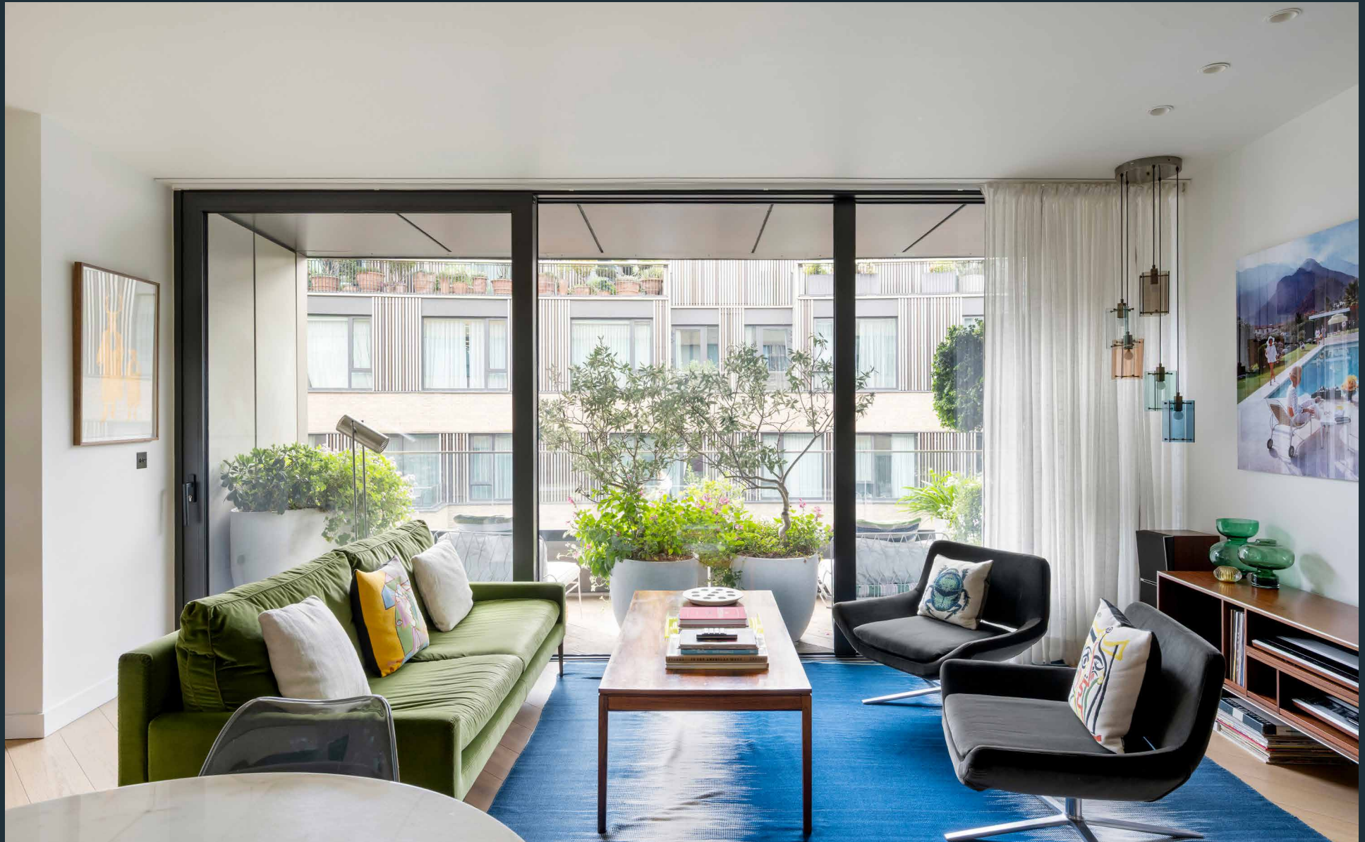
Television Centre, W12 £1,100,000