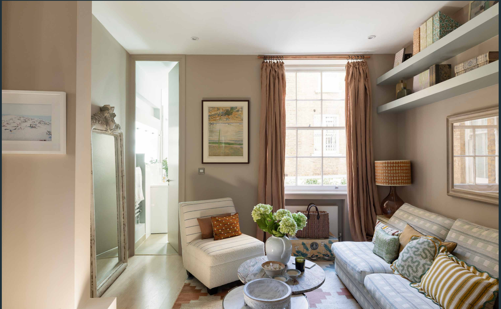
Mount Carmel Chambers W8 £795,000