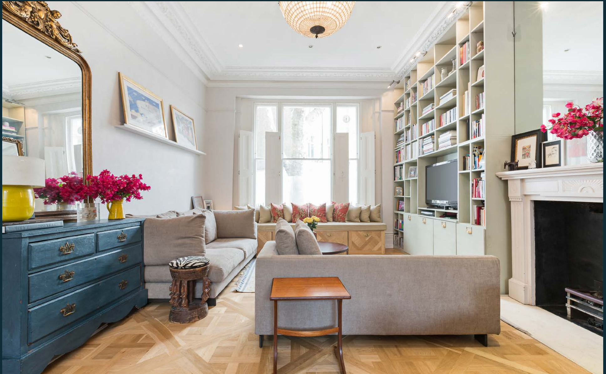
Linden Gardens W2 £1,625,000