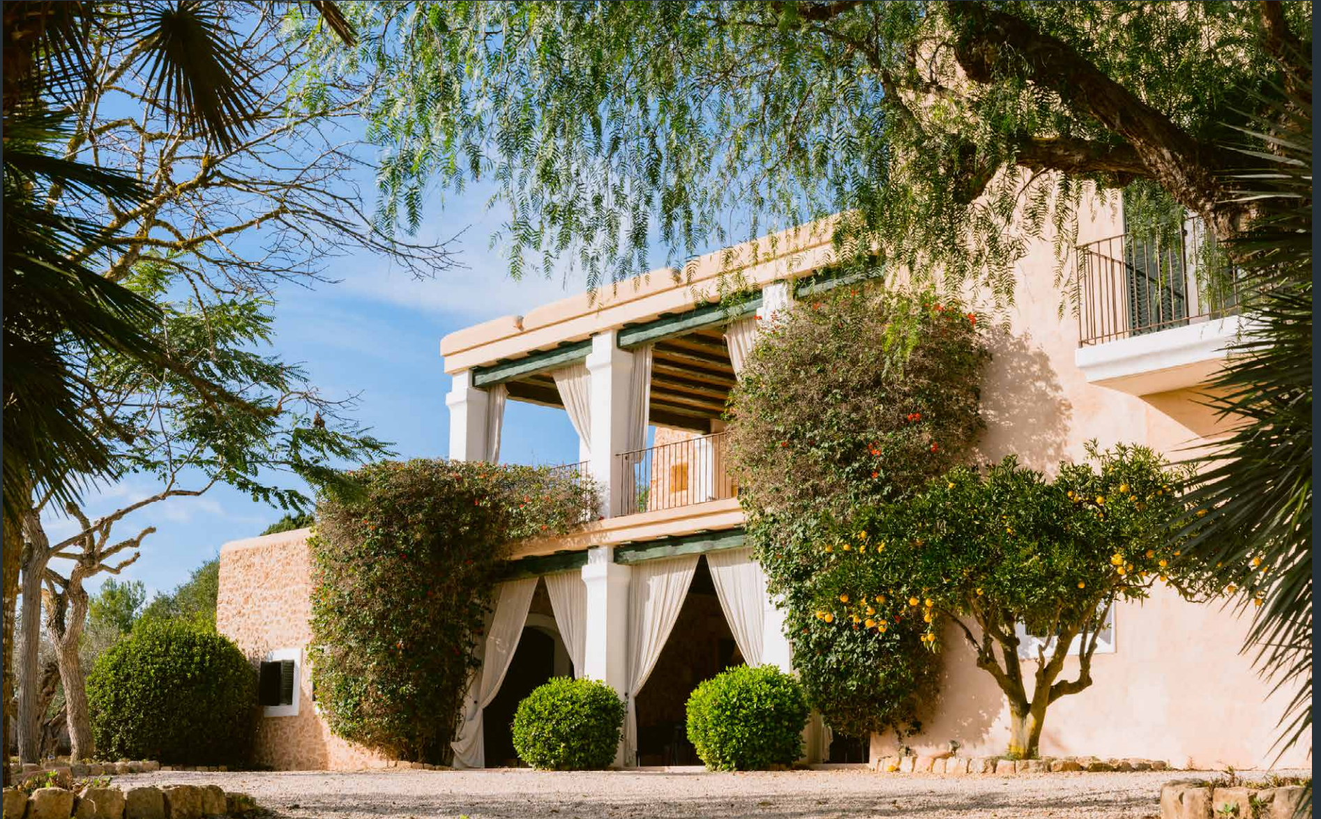
Villa Vicent, North East Ibiza