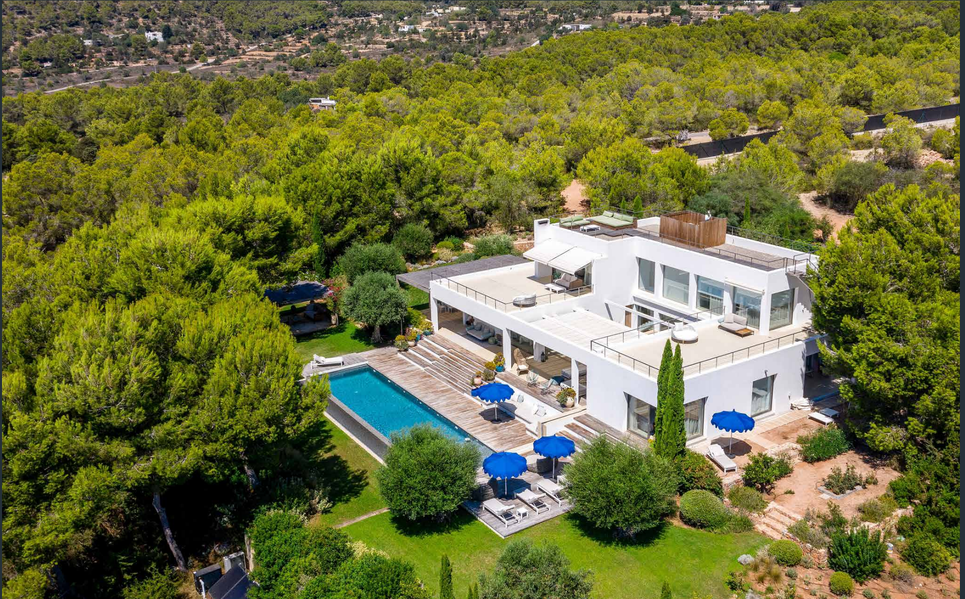
Villa Rosa, South East Ibiza