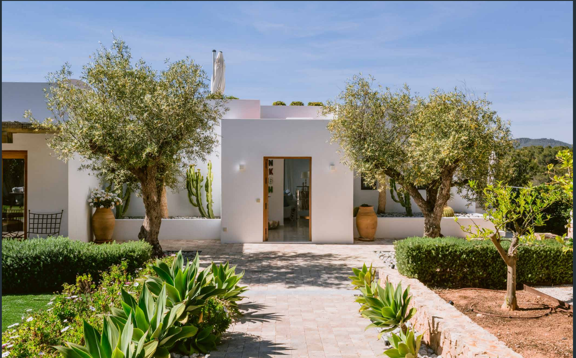
Villa Porriog, South West For 10 guests