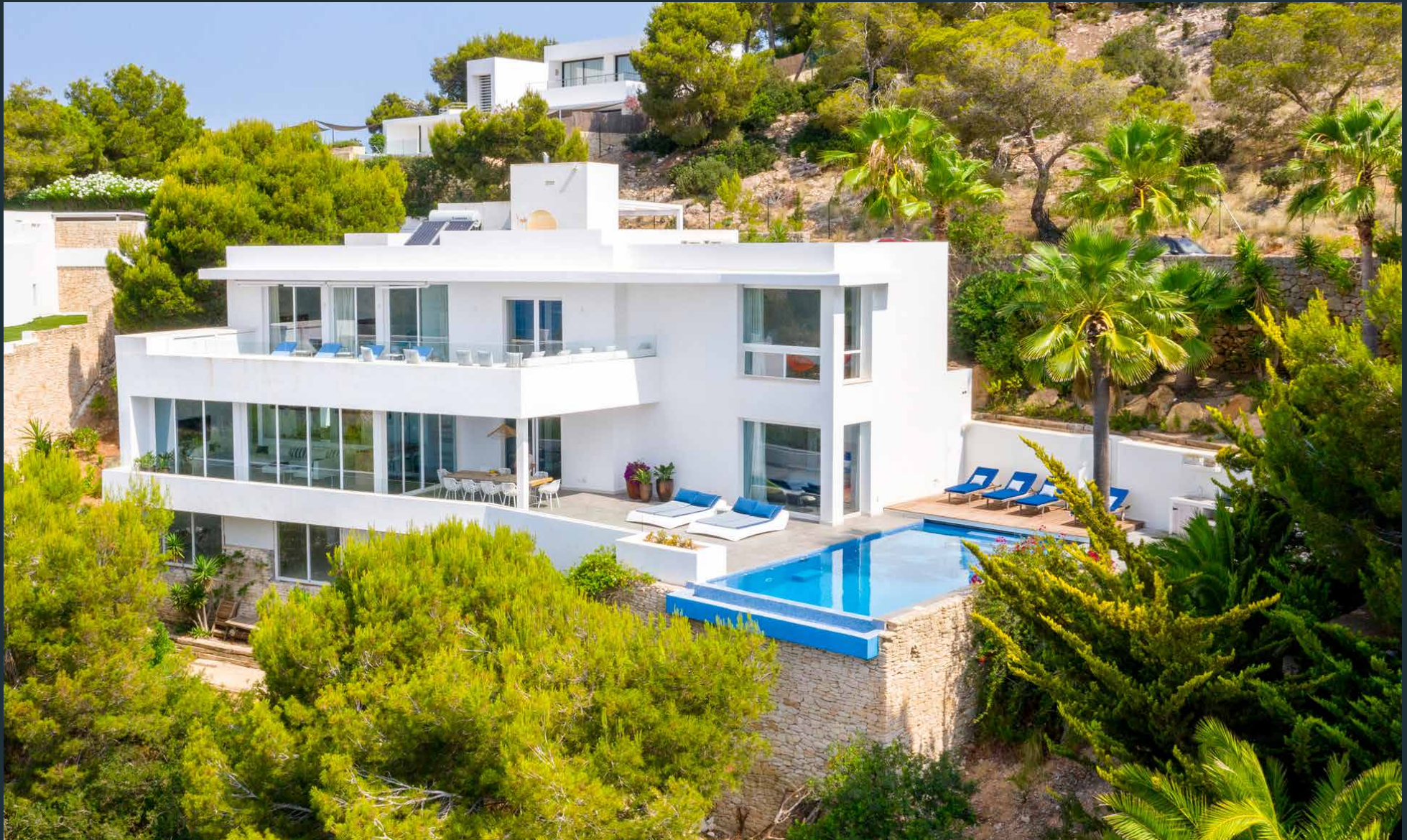
Villa Costera, Roca Lisa - For 10 guests

In partnership with BARNES INTERNATIONAL REALTY