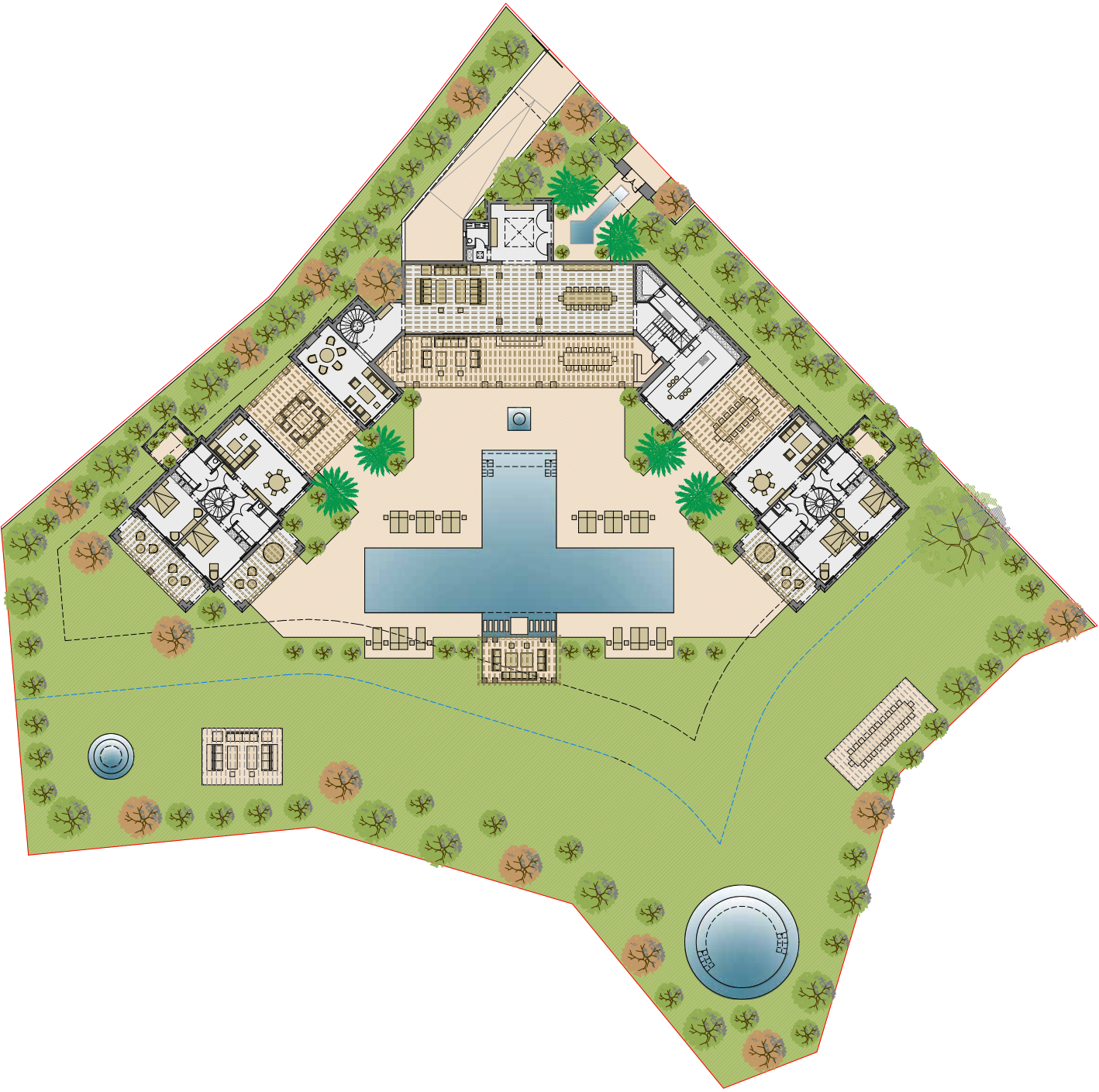
Proposed Ground Floor