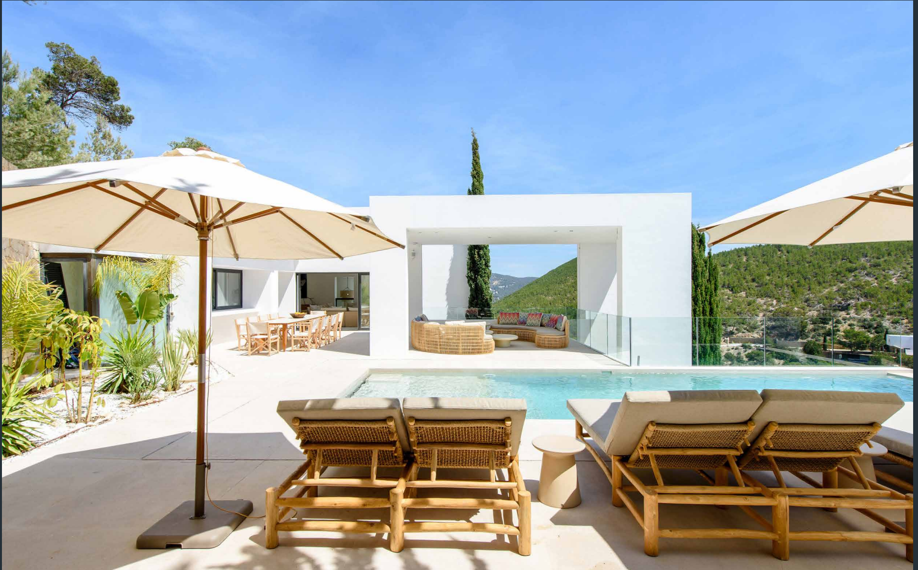
Villa Infinidad, Roca Llisca