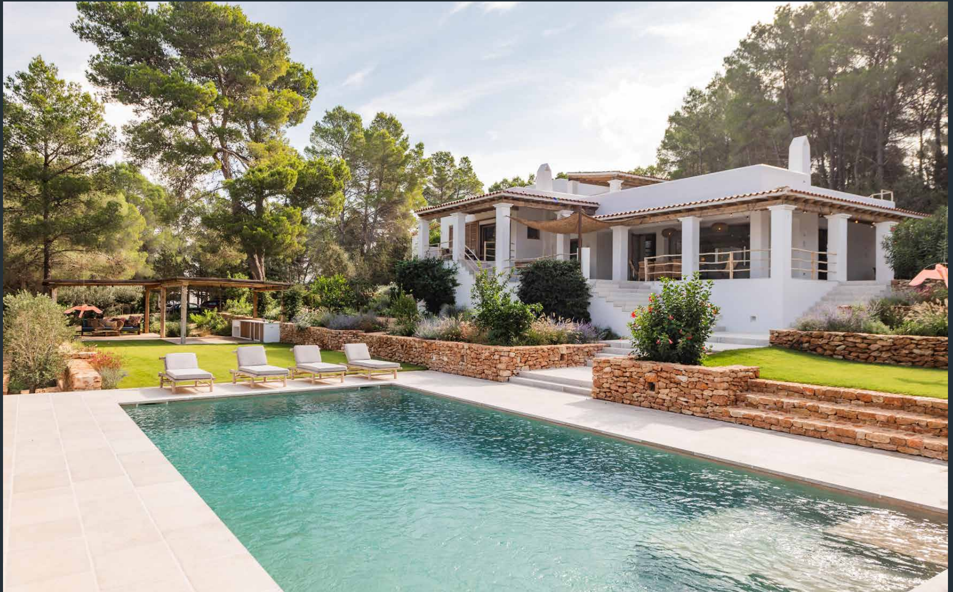
Villa Bellavista, South West Ibiza