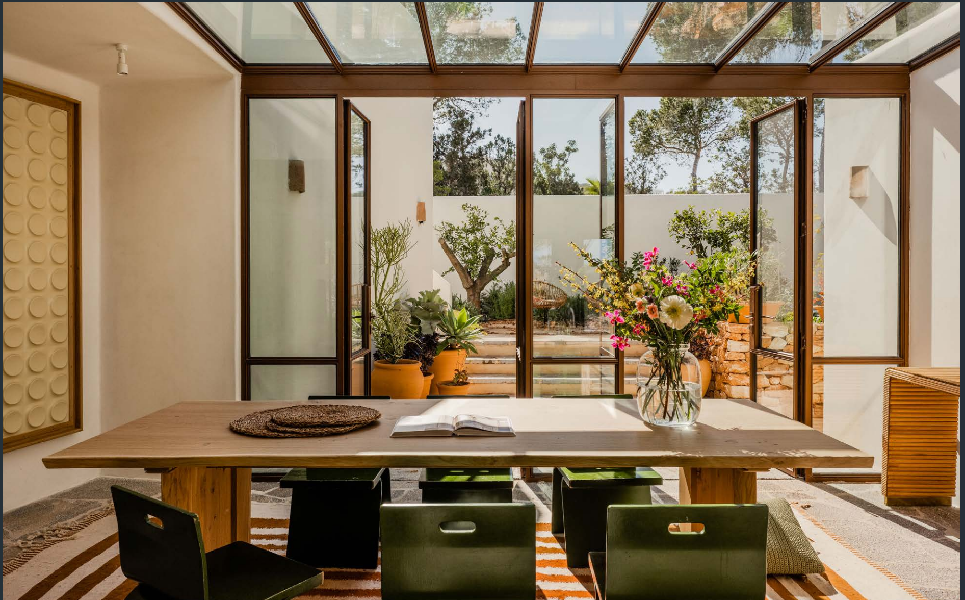
Casa Del Árbol For 10 guests