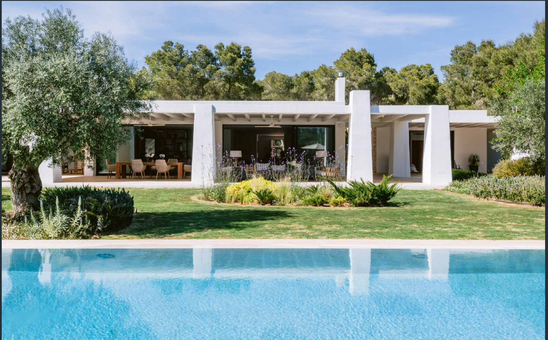
Casa Chumbera, Es Cubells