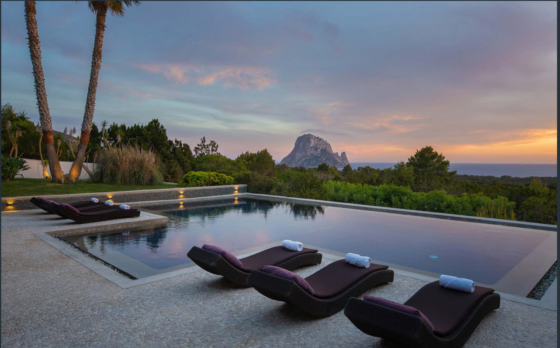
Casa Callao, South West For 8 guests