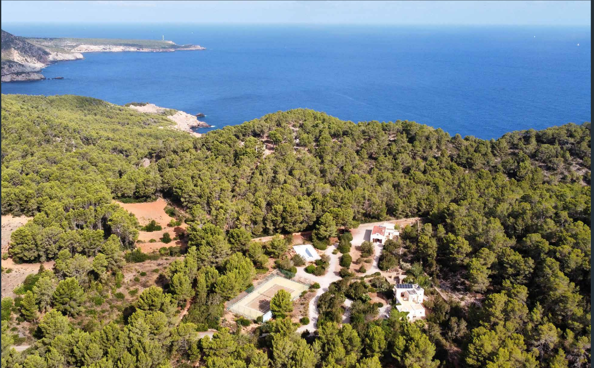
Can Stefano, North East Ibiza €4,750,000