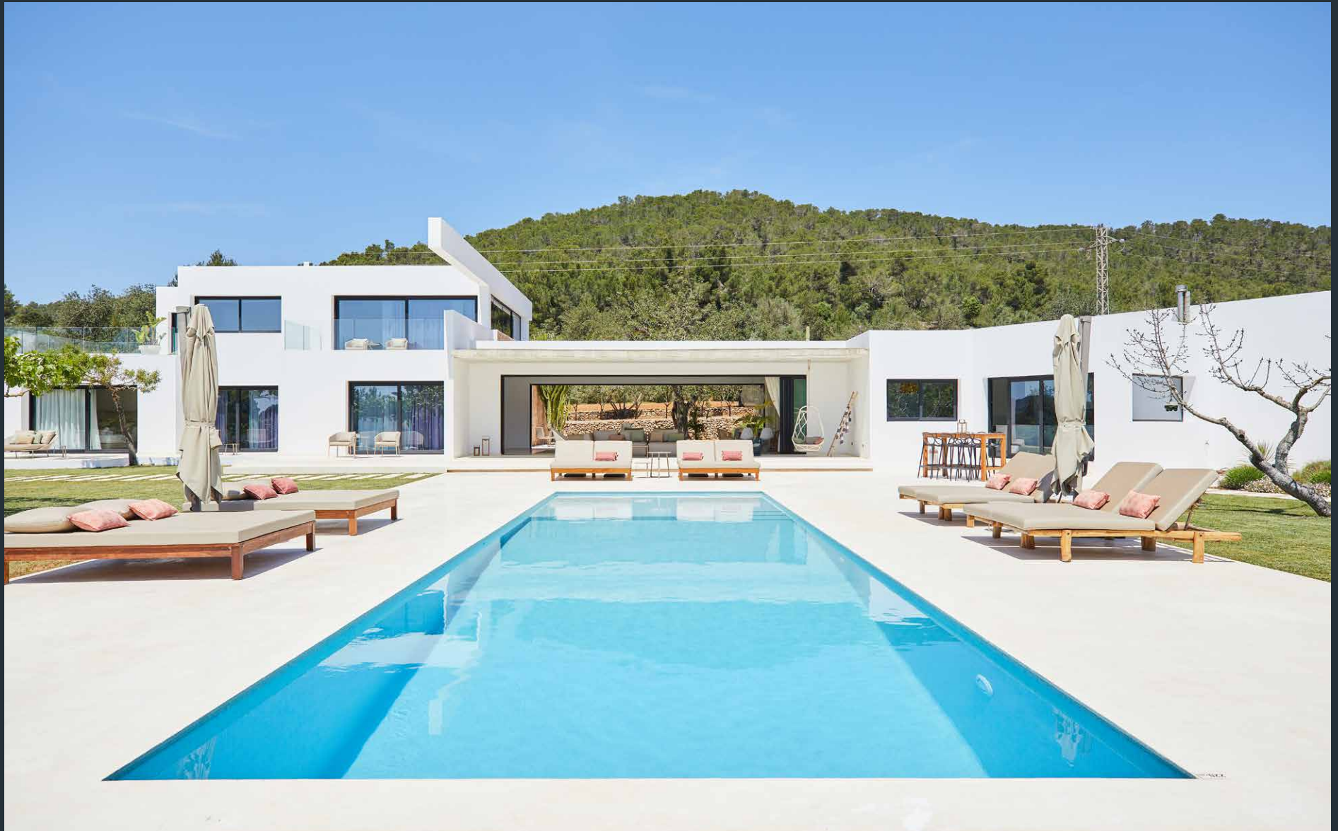
Can Mira, North Ibiza For 16 guests