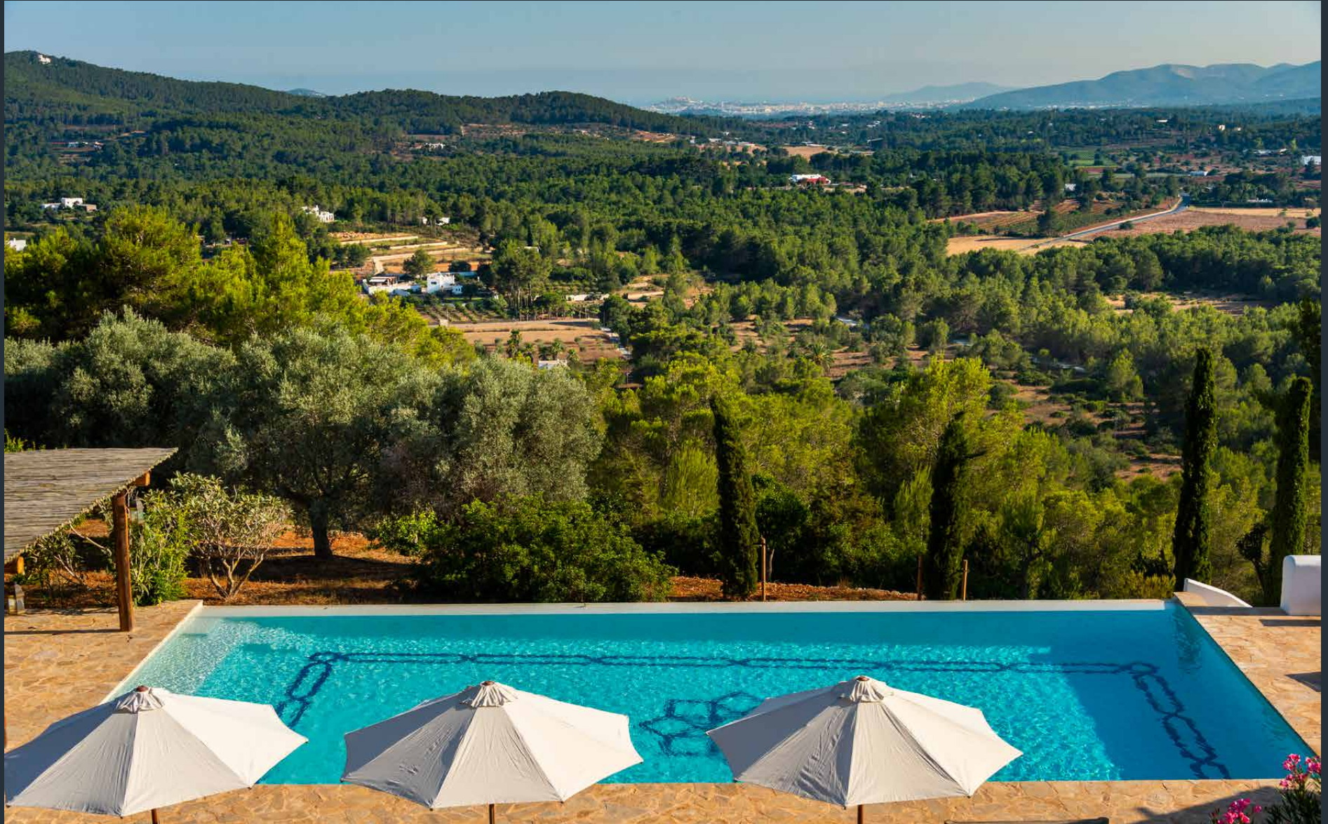
Can Mayans, Santa Gertrudis For 12 guests