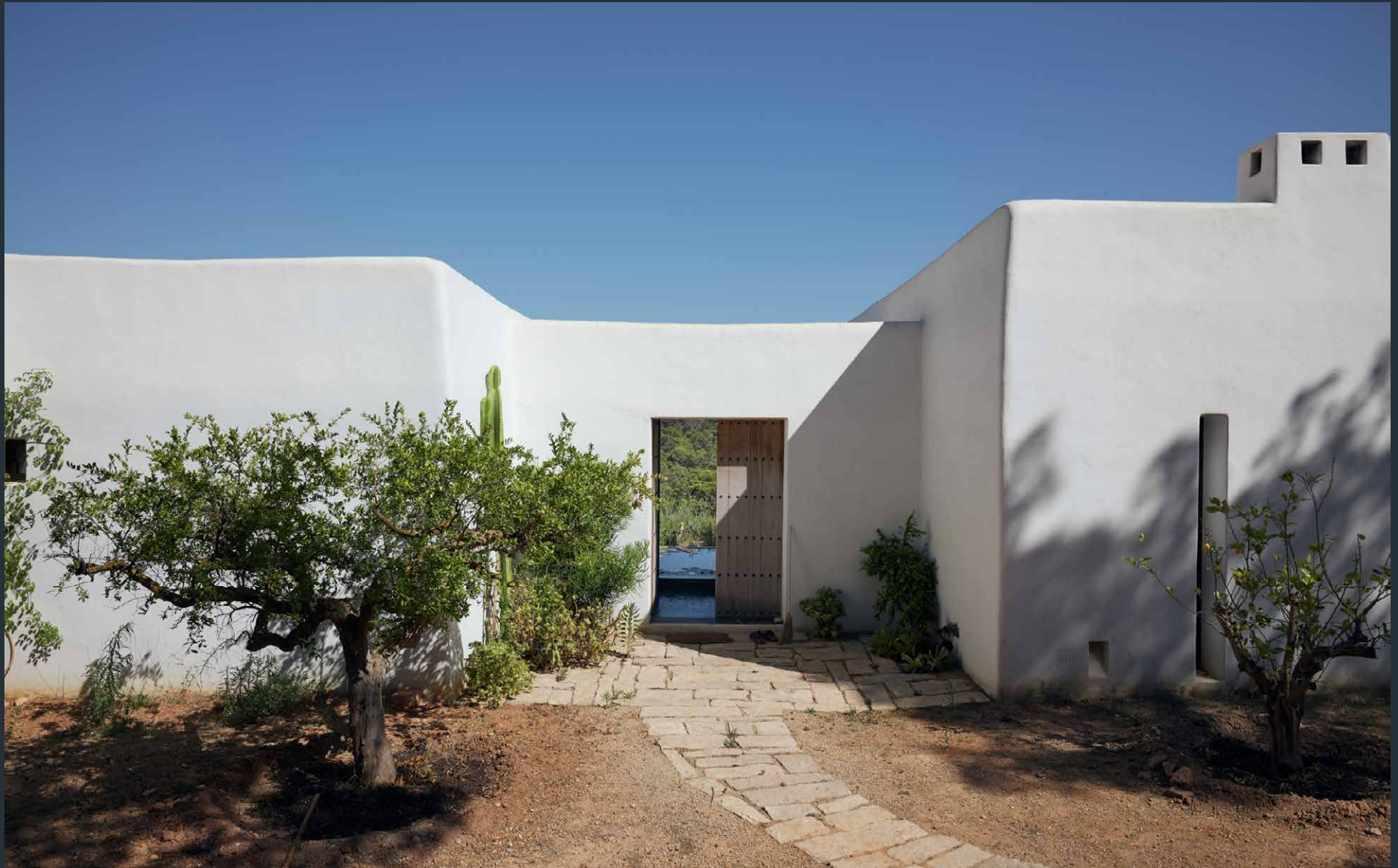
Finca Lluna, San Carlos For 8 guests