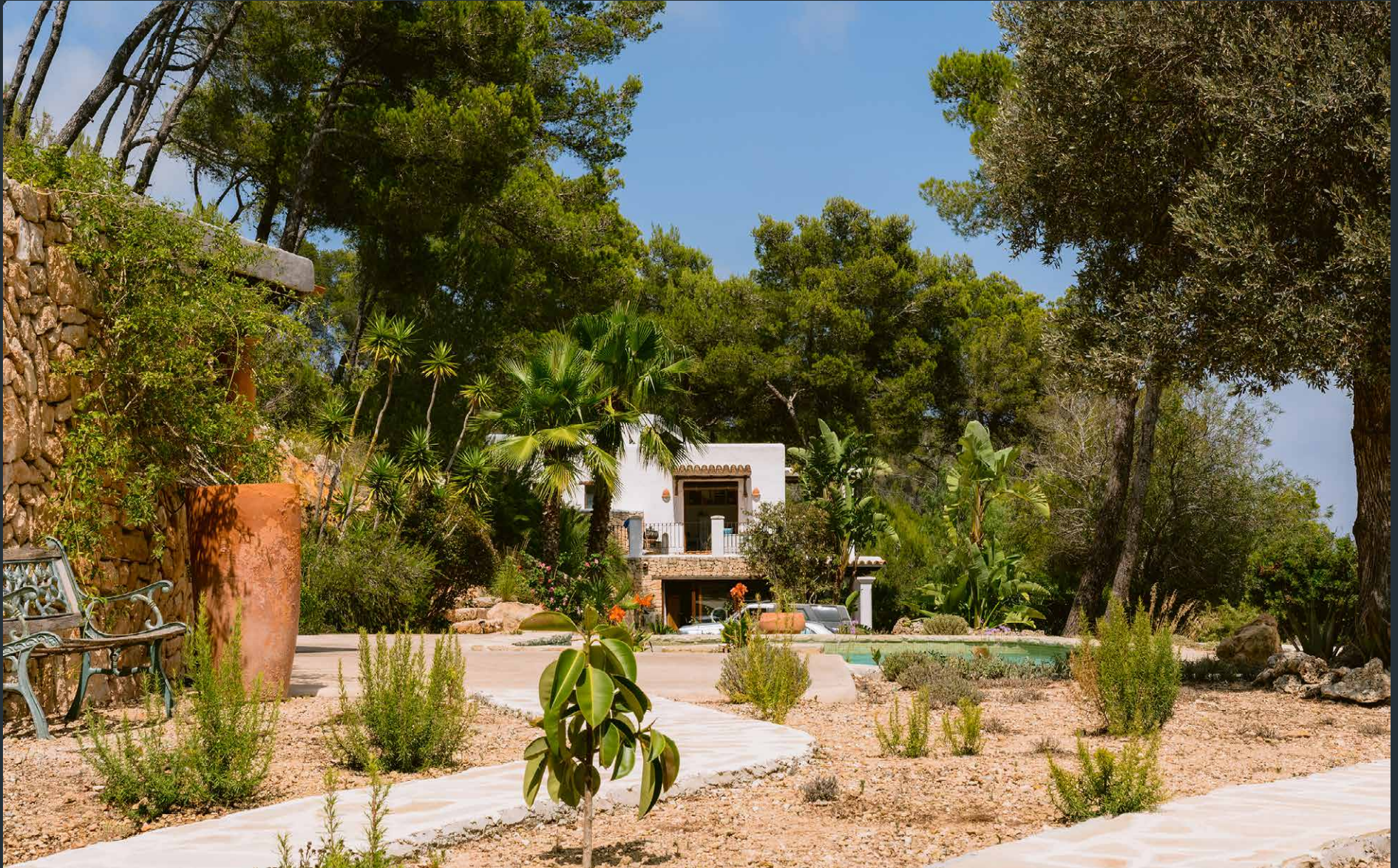
Can Falco, North East Ibiza €2,950,000