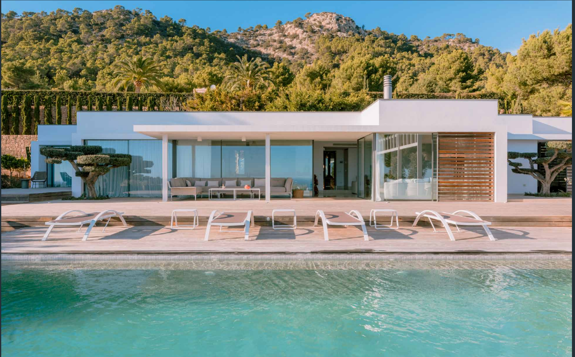
Can Escenario, Es Cubells For 8 guests